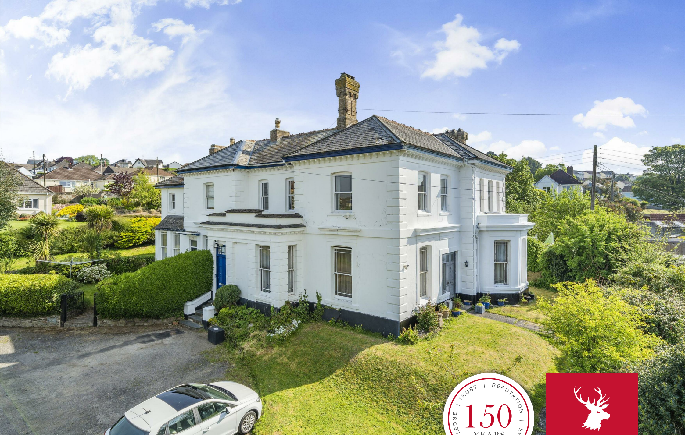
2 Lauderdale House